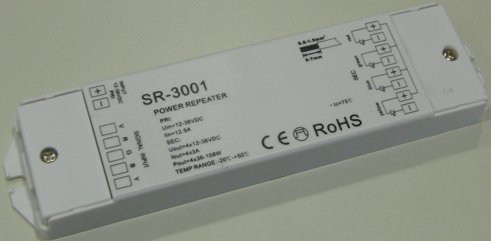
LED-SR-3001 Four channel Repeater